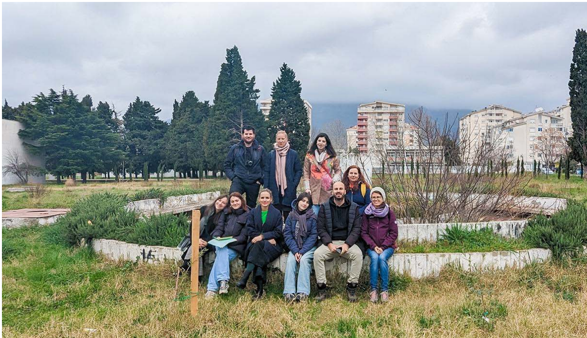
Five teams of experts from the Western Balkans in the courtyard of local high schools in Bar - one of the five future pilot locations where they will work together with children to improve the conditions for play.

Bar, 8th March 2023 - International Women's Day was celebrated with a partners meeting and preparation for the implementation of a pilot program under the RE:Play (Redesigning playscapes with children in the Western Balkans) project. This initiative is funded by the European Creative Europe Fund and aims to involve children as the end users in the collaborative and co-creative process of designing new playgrounds.